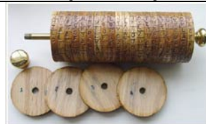
Jefferson's Cipher wheel consisted of 26 numbered wooden wheels on a metal spindle with letters randomly inscribed around the edge of each wheel.

The summer is a great time to head-off "to the fields" to visit places related to Madison. Of course, one of America's greatest destinations is Washington, D.C. So, if you're headed there, be sure to ask your legislators about their positions on HR 3640. I'll also be in Charlottesville, VA exploring the original letters of James Madison preserved in vaults at the University of Virginia. Later, I'll travel to Madison's Montpelier in Orange, VA to join in the final preparations for the September 17th grand re-opening of the "great house" after a 4-year historically accurate restoration. It should be fun. Perhaps we'll cross paths!