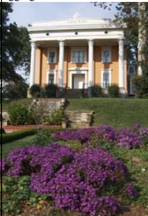
The Lanier Mansion is the 1844 Greek Revival home of James F. D. Lanier, located at 601 West First Street in historic Madison, Indiana.

With over 1,520 structures from the 19 th century, the city features Federal and Greek Revival architecture and 133 blocks listed on the National Register of Historic Places making it—in the aggregate—one of the Nation's largest historical sites.